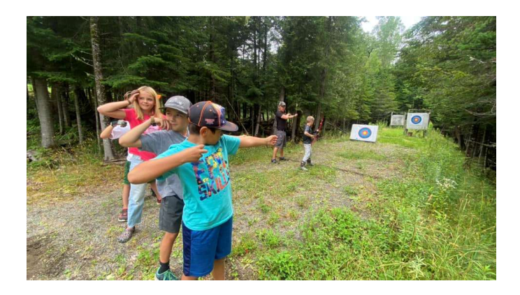
The Rangeley Junior Guides 2024 summer program completed another successful and engaging year. Both the

basic and advanced groups were involved in ambitious and challenging indoor and outdoor learning experiences.