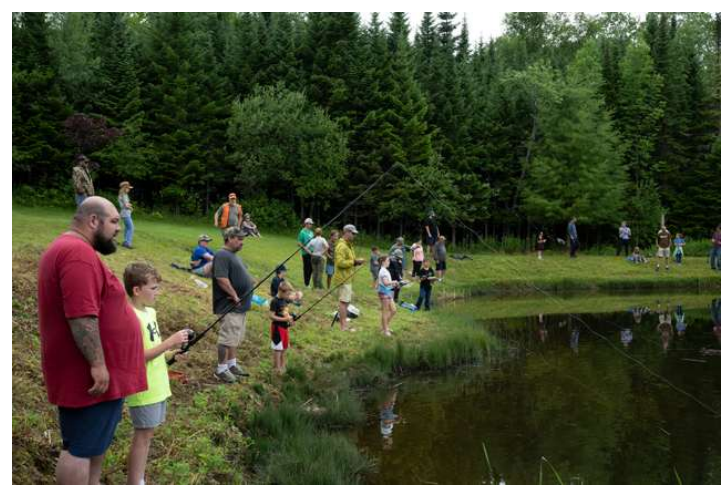
After several years of perfect weather, we got a little wet but then it stopped raining and kids were catching trout.

The Kids' Fishing Derby was a big hit again this past year.